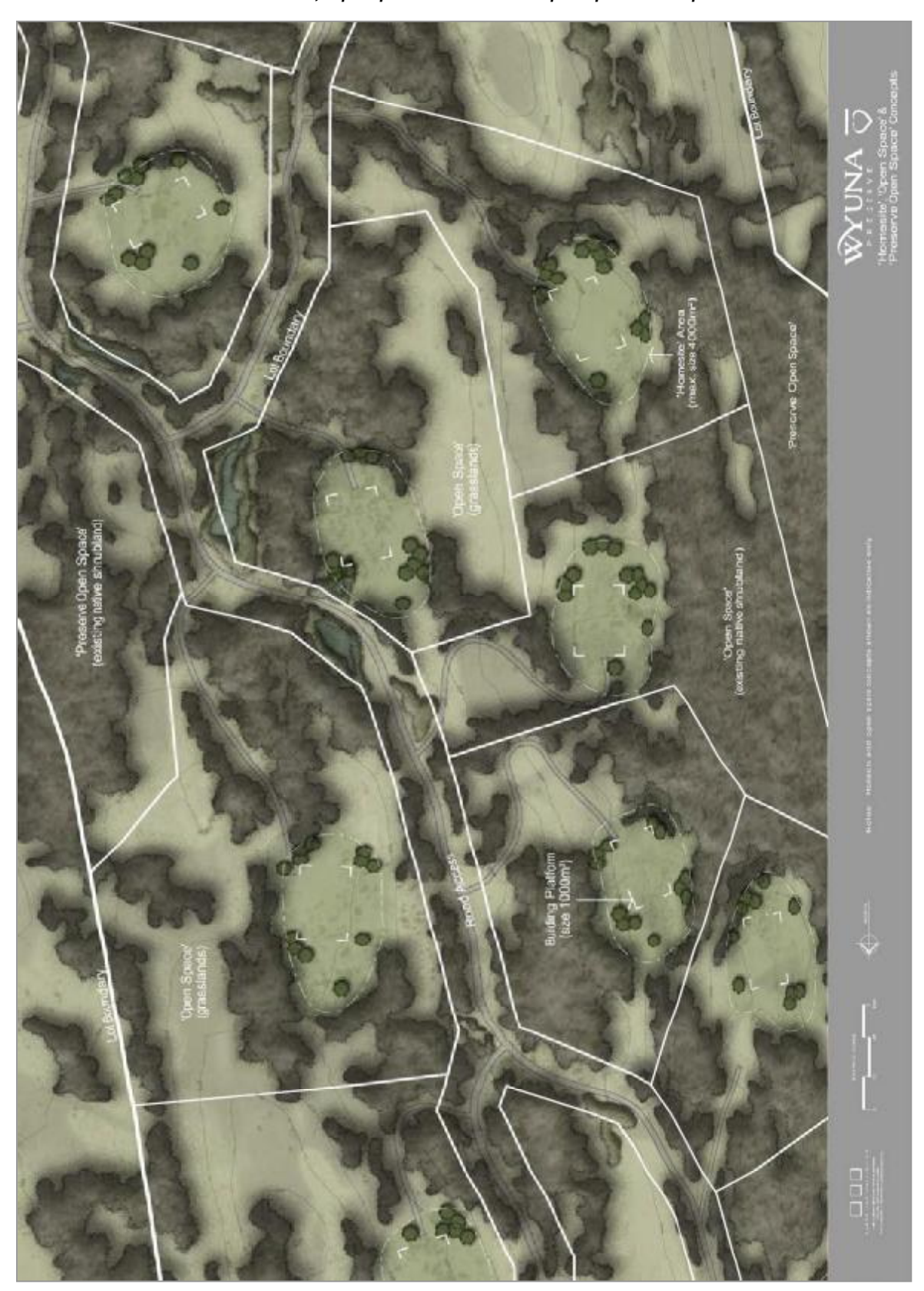
APPENDIX 1: 'Homesite, 'Openspace' and 'Preserve Open Space' Concepts