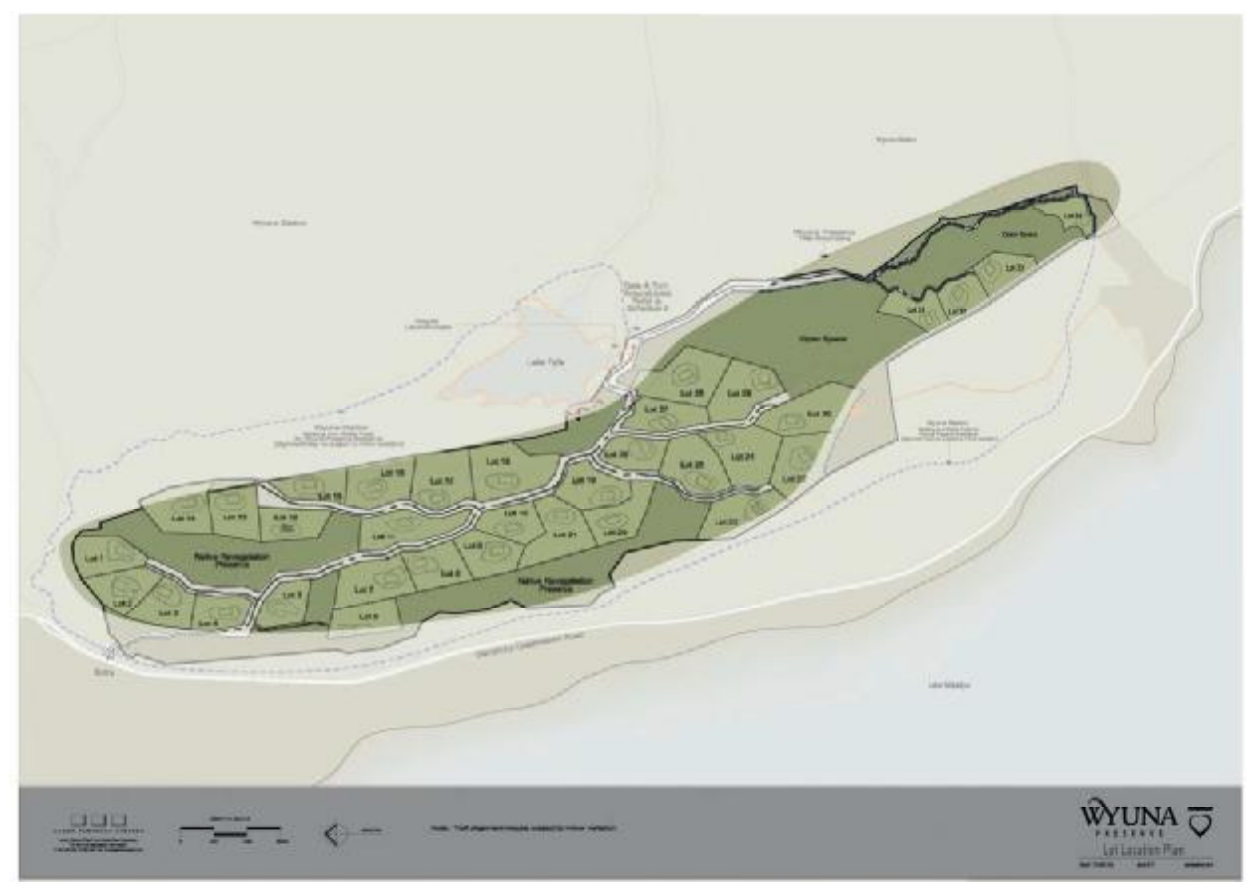
Figure 1: Rural Lifestyle Zone

These controls refer to the following Rural Lifestyle Zone areas ( Refer Figure 1 ). All allotments referred to in these design guidelines are highlighted below in green.